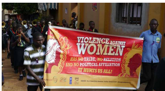
A community march in an area of Kampala organised by activists in the SASA! programme.

These questionnaires are publicly available along with training materials and offer additional examples of complimentary questions that may be used during survey research.